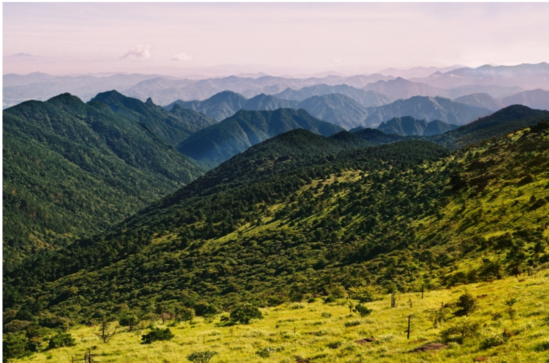
Wuyi Shan (CN408), which is located on the border between Fujian and Jiangxi provinces, was one of the first sites where ornithological research was conducted in mainland China.

Key: ● = Protected; ◐ = Partially protected; ○ = Unprotected.