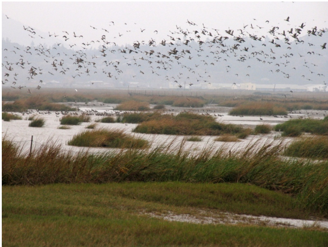
The Min Jiang Estuary (CN411), which is in the suburbs of Fuzhou city, is a wintering and stop-over site for several globally threatened bird species.

IMPORTANCE TO OTHER FAUNA AND FLORA: No information.